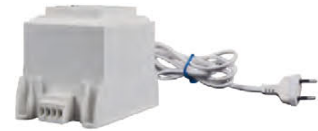
Netzteil Basic EI 300 W AP/UP Power supply Basic EI 300 W AP/UP