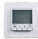
Raumthermostat EN 01 (inkl. externen Temperaturfühler, Versorgung 230 V) Room thermostat EN 01 (incl. external temperature sensor, supply 230 V)