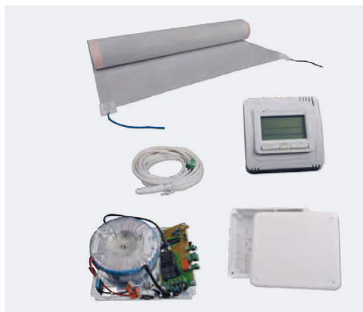
Badezimmer-Set 01 | 3-4 m 2 880,00 € Bathroom set 01 | 3-4 m 2 880.00 € Art-Nr. Item-no. 2 97 010

PUR-Zwillingsleitung und Quetschverbinder müssen individuell zur Bestellung ergänzt werden. PUR twin cable and crimp connector must be added individually when ordering.