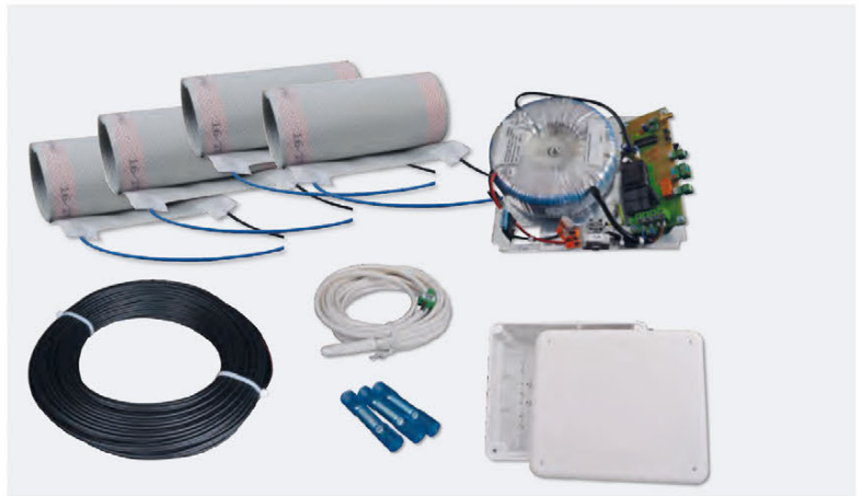
Feuchteschutz-Set 04 Moisture protection set 04 875,00 € Art-Nr. Item-no. 2 97 004 875.00 €

Inhalt: 1x Netzteil HT 100 W AP, 2x Heizfolie E-ENERGY CARBON FLEECE S 36 V – 25 W/lfm (145 W/m 2 ) 2 m Contents: 1x power supply HT 100 W AP, 2x Heating E-ENERGY CARBON FLEECE S 36 V – 25 W/lfm (145 W/m 2 ) 2 m