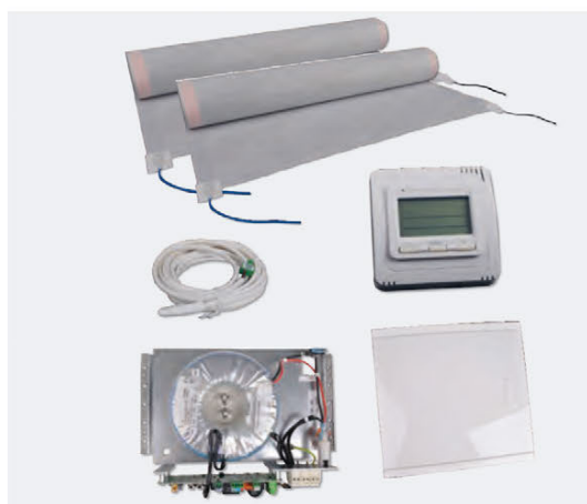
Badezimmer-Set 02 | 7-8 m 2 1.555,00 € Bathroom set 02 | 7-8 m 2 1,555.00 € Art-Nr. Item-no. 2 97 011

Inhalt: 1x Netzteil Basic TT 400 W AP/UP, 3x Heizfolie 36 V – 66 W/lfm (110 W/m 2 ), 2 m, 1x Raumthermostat EN 01 Contents: 1x power supply Basic TT 400 W AP/UP, 3x heating foil 36 V – 66 W/lfm (110 W/m 2 ), 2 m, 1x room thermostat EN 01