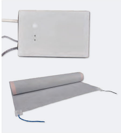
Feuchteschutz-Set 01 390,00 € Moisture protection set 01 390.00 € Art-Nr. Item-no. 2 97 001

Inhalt: 1x Netzteil HT 100 W AP, 1x Heizfolie 36 V – 36 W/lfm (60 W/m 2 ), 2,5 m Contents: 1x power supply HT 100W AP, 1x heating foil 36 V – 36 W/lfm (60 W/m 2 ), 2.5 m