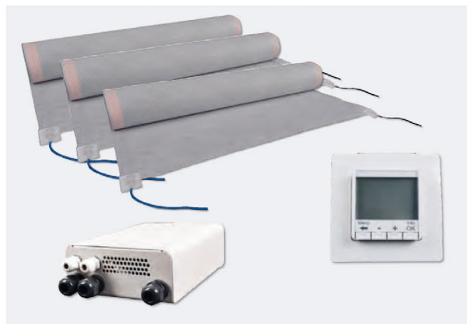
Badezimmer-Set 03 | 3-4 m 2 825,00 € Bathroom set 03 | 3-4 m 2 825.00 € Art-Nr. Item-no. 2 97 012

Inhalt: 1x Heizfolie 36 V – 66 W/lfm (110 W/m 2 ), 6 m, 1x Netzteil HT 400 W UP kompakt, 1x Einbaukasten HT UP kompakt, 1x Externer Temperaturfühler, 1x Raumthermostat UP (programmierbar) Contents: 1x heating foil 36 V – 66 W/lfm (110 W/m 2 ), 6 m, 1x power supply HT 400 W UP compact, 1x installation box HT UP compact, 1x external temperature sensor, 1x room thermostat UP (programmable)