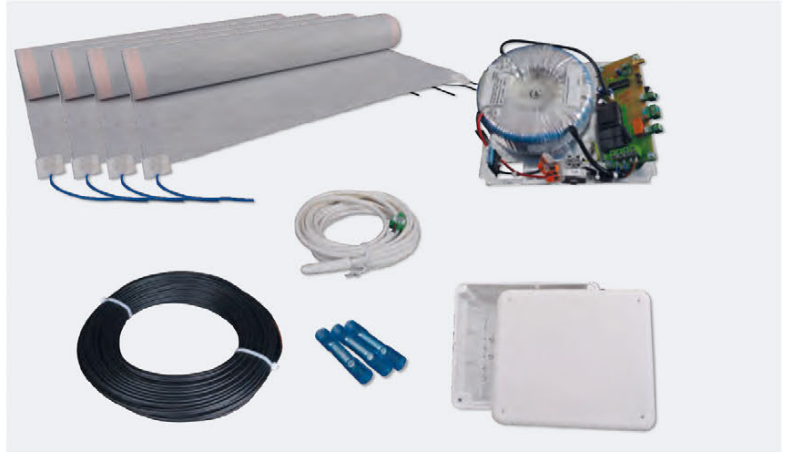
Feuchteschutz-Set 02 Moisture protection set 02 1.090,00 € Art-Nr. Item-no. 2 97 003 1,090.00 €

Inhalt: 1x Netzteil HT 100 W AP, 1x Heizfolie 36 V – 36 W/lfm (60 W/m 2 ), 2,5 m Contents: 1x power supply HT 100W AP, 1x heating foil 36 V – 36 W/lfm (60 W/m 2 ), 2.5 m