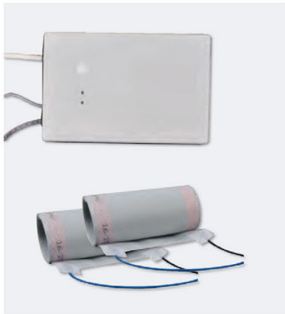
Feuchteschutz-Set 03 390,00 € Moisture protection set 03 390.00 € Art-Nr. Item-no. 2 97 002

Inhalt: 1x Netzteil HT 400 W UP kompakt, 1x Externer Temperaturfühler, 1x Einbaukasten HT UP kompakt, 4x Heizfolie E-ENERGY CARBON FLEECE 36 W/lfm (60 W/m 2 ) 2,5m, 1x PUR-Zwillingsleitung 25 m, 1x Quetschverbinder 2,5 mm 2 (20 Stk.) Contents: 1 x power supply HT 400 W UP compact, 1x external temperature sensor, 1x installation box HT UP compact, 4x heating foil 36 V – 36 W/lfm (60 W/m 2 ), 2.5m, 1x PUR cable strand 25 m, black, 1x PUR cable lead 25 m, blue, 1x crimp connector 2.5 mm 2 (20 pcs.)