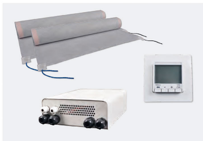
Badezimmer-Set 04 | 7-8 m 2 1.355,00 € Bathroom set 04 | 7-8 m 2 1,355.00 € Art-Nr. Item-no. 2 97 013

Inhalt: 2x Heizfolie 36 V – 66 W/lfm (110 W/m 2 ), 6 m, 1x Netzteil HT 800 W UP, 1x Einbaukasten HT UP, 1x Externer Temperaturfühler, 1x Raumthermostat drahtgebunden UP (programmierbar) Contents: 2x heating foil 36 V – 66 W/lfm (110 W/m 2 ), 6 m, 1x power supply HT 800 W UP, 1x installation box HT UP, 1x external temperature sensor, 1x room thermostat wired UP (programmable)